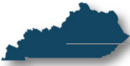
Figure 12.a: Criminal Justice Enacted Budgets, FY 2005